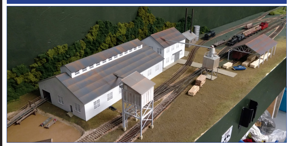
The lumber mill at Robbinsville continues its expansion with a new planing building and its sawdust bin, plus a loading shed. Still to come: overhead steam lines, many, many stacks of lumber, a kiln building, and lots of ballasting/scenery work.