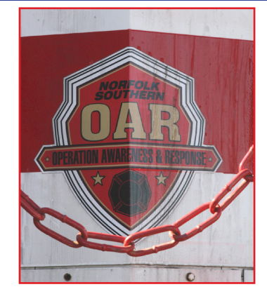
Above, the OAR nose emblem was still showing road dirt when photographed on February 10.

At right, the control stand of the GP38-2.