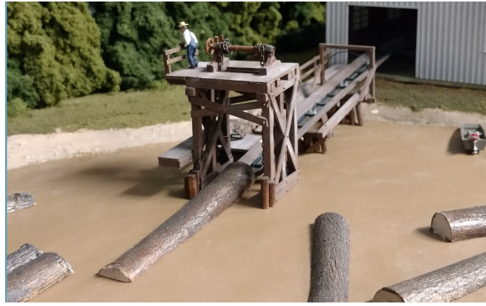
The new scratch-built jack slip at the log pond was based on old photographs.