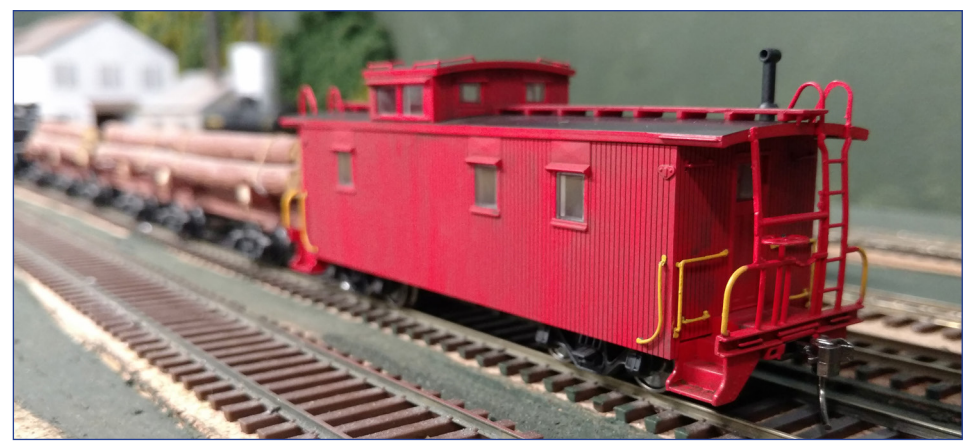
The Graham County Railroad has a new (to them) caboose that still needs lettering and numbering.