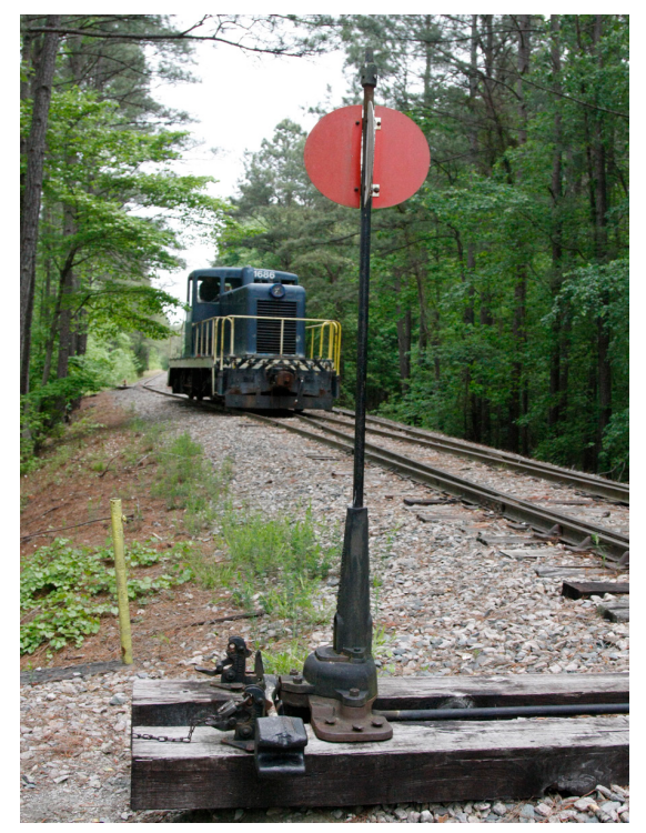
Operating sessions include lessons on unlocking and throwing switches....

The New Hope Valley Railroad and the North Carolina Railroad Museum are a few hours away just south of Raleigh. Along with viewing its outstanding collection of North Carolina rolling stock, you can buy an operating session on the 4-mile line at the throttle of either a steam or diesel locomotive. For more information, go to www.triangletrain.com