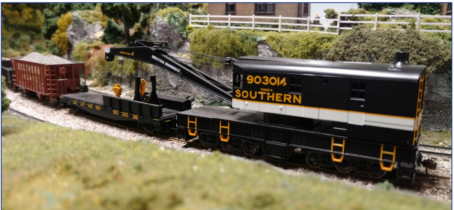
Freshly-painted derrick 903014 awaits the call at Asheville.