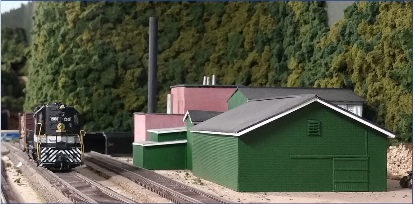
A local behind a GP-38 gets ready to drop a pulpwood rack off at the mill in Sylva.