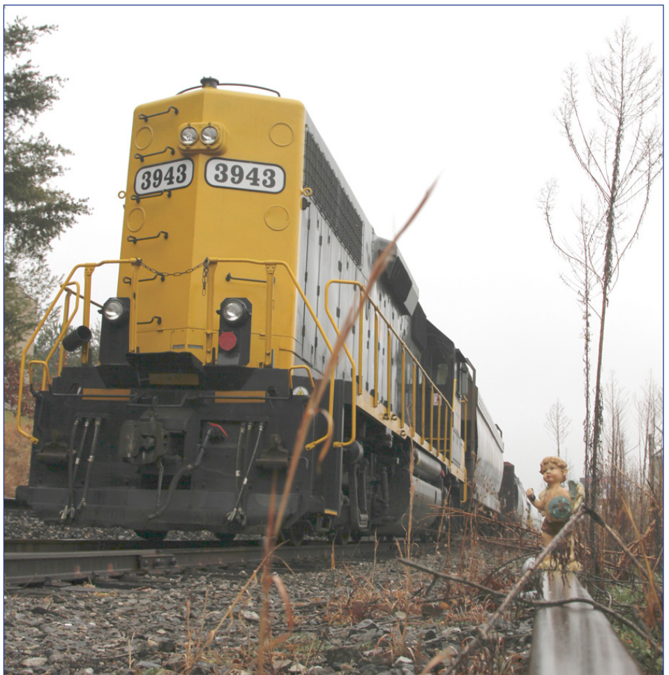
LOOK HOMEWARD ANGEL? Arden is a few miles away from Tom Wolfe's old stomping grounds in Asheville, but a plastic cherub sitting on a unused rail seems right at home. Editor's note: this shot was unstaged: the angel was an apparent refugee from a neighboring business's trash pile.