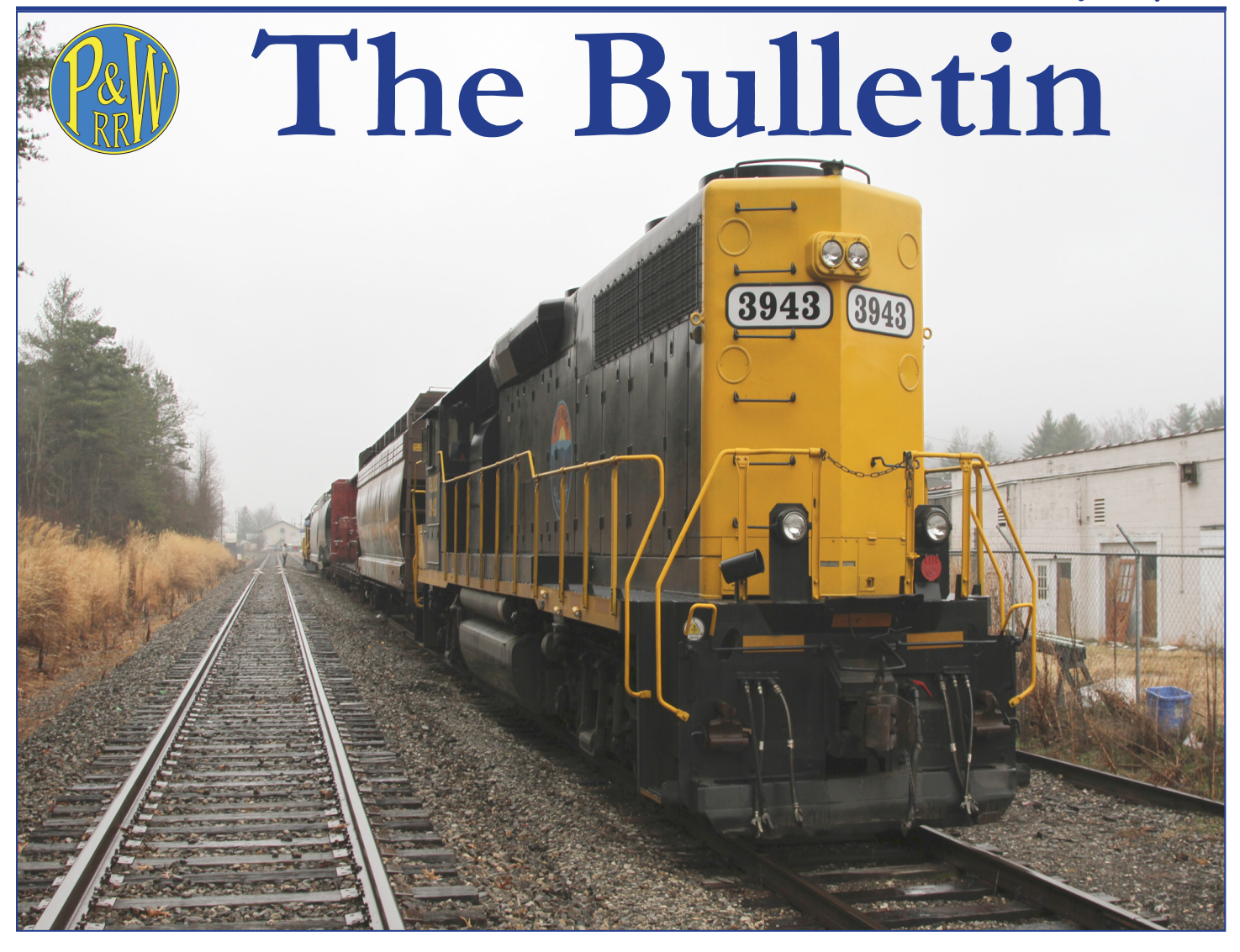
The P&W visits the Blue Ridge Southern Railroad- see page 3.