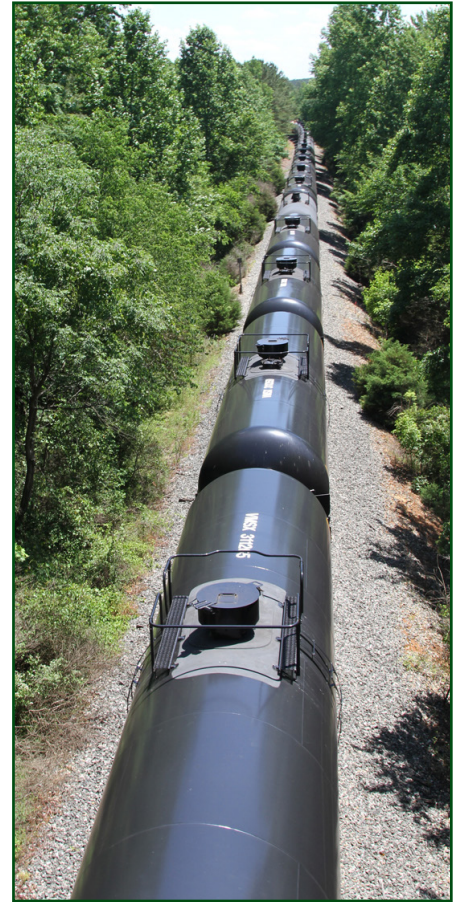
Passing over a Winston-Salem Southbound Railway ethanol train at Norwood.