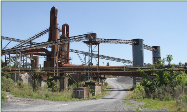
The rotary kiln at the concrete block plant near Oakboro appears to have turned its last some years ago.