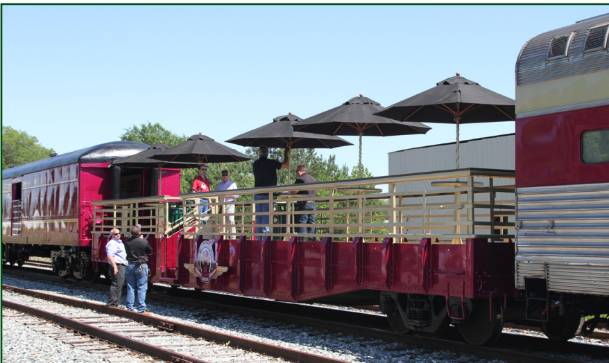
The editor's on-board camera location of choice: No. 401 is a flat car converted into the AC&W's Patio Car , complete with umbrellas and cup holders around the top railing.