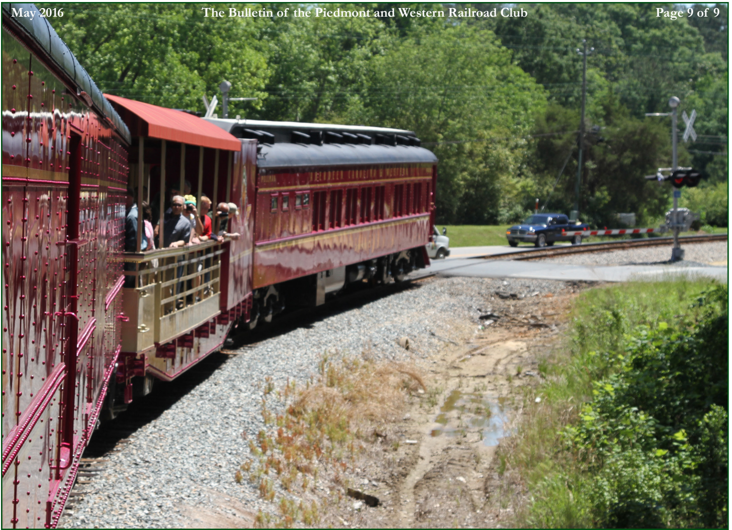
LOOKING BACK: The view of the rest of the train as seen from the Patio Car . We are looking at baggage car No. 901; converted flat No. 402, the Canopy Car , and No 7014, the Pineburst , a beautiful Pullman-built heavyweight.

Many thanks to all the railroaders of the Aberdeen Carolina & Western who gave up their Saturday to give us an unforgettable ride on their railway.