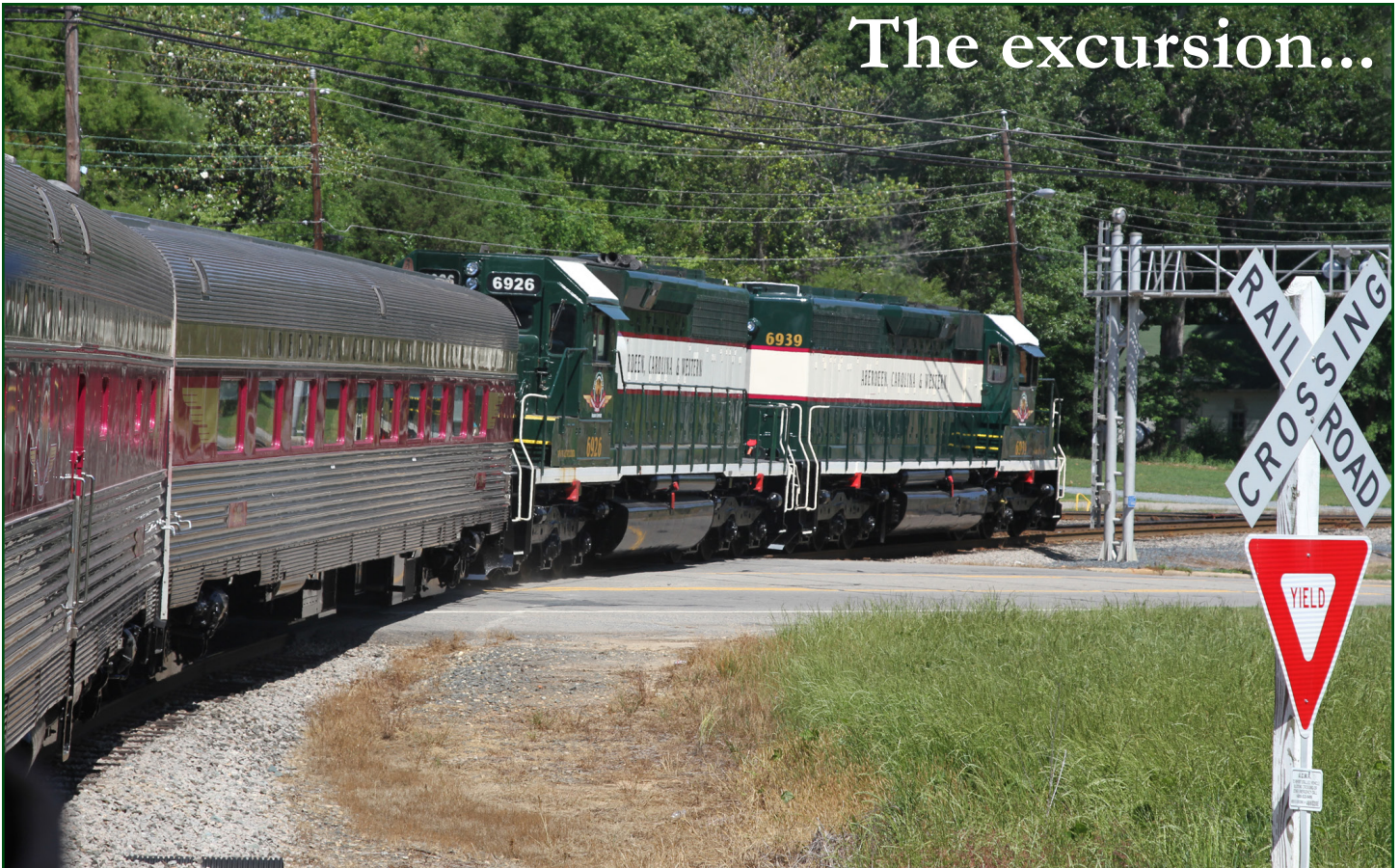
LOOKING TO THE FRONT: The leading rolling stock was No. 300, one of AC&W's two twin-unit dining car sets which has counted AutoTrain, Seaboard Coast Line, Atlantic Coast Line, and the Chesapeake and Ohio as owners. The train is shown backing to the Star depot to get to the main line to Charlotte.