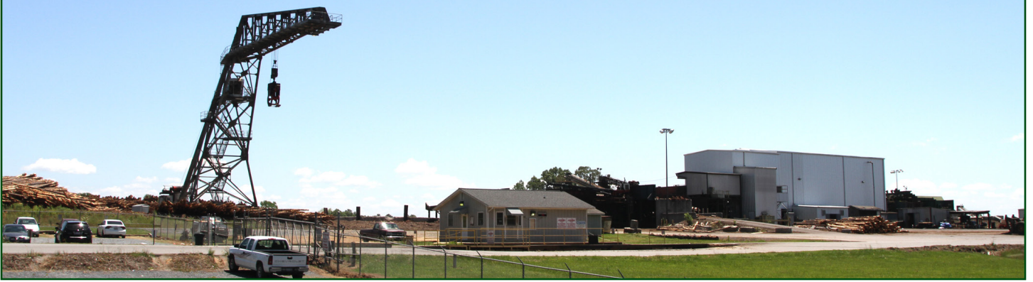
This shot captures just a fraction of one of Jordan Lumber Company's operations.