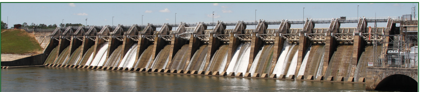
A partial view of the Lake Tillery Dam from the bridge over the Pee Dee River.