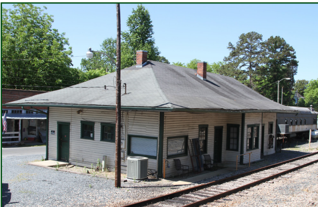
The former original Norfolk Southern depot in Star served as the Aberdeen Carolina & Western's previous headquarters and shops location. The railroad's drop pit and fueling operations are still located in Star.