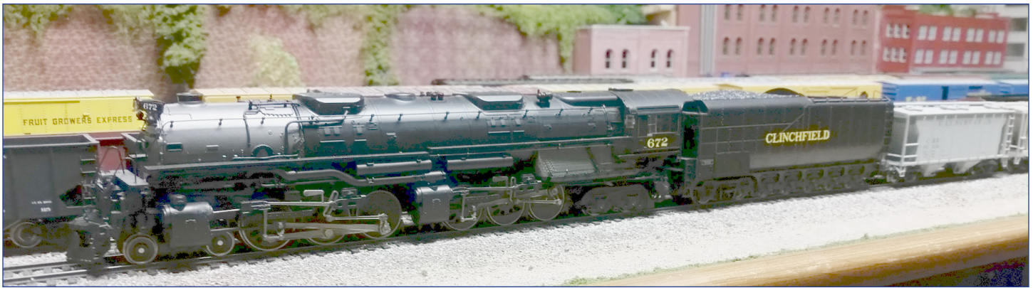
Clinchfield Railroad steam lives on in 1/87 scale on the P&amp;W...