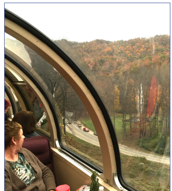
Andrews Geyser outside of Old Fort.