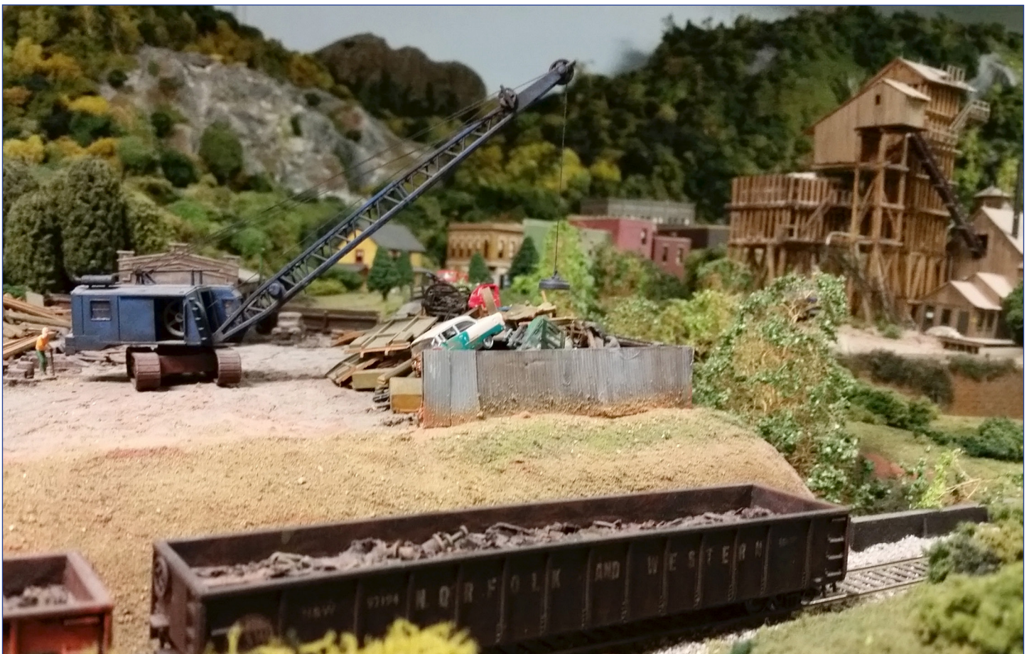
The Old Fort scrap yard on the P&W.

The P&W will not be open on Thanksgiving evening, November 26 !