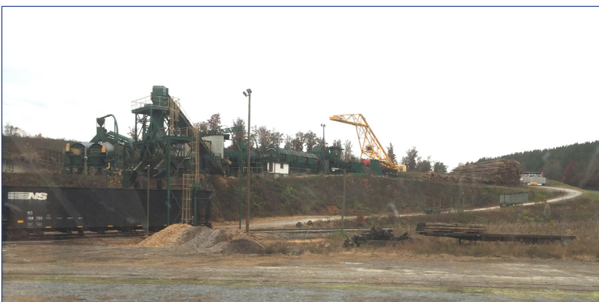
The wood chip facility in Nebo.