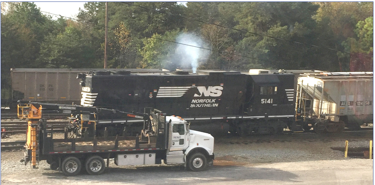
Working the Oyama Yard, NS GP-38-2 No. 5141 was a October 1974 EMD product for the Southern Railway.