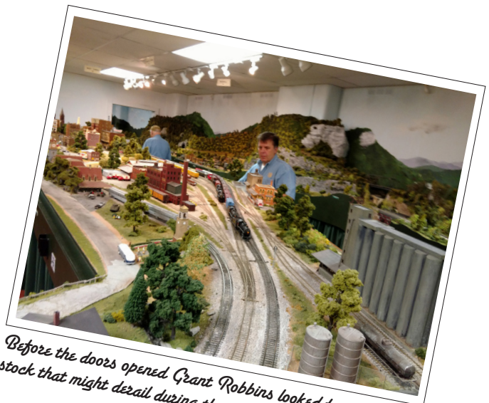
Before the doors opened Grant Robbins looked for rolling stock that might derail during the event. He just found one...